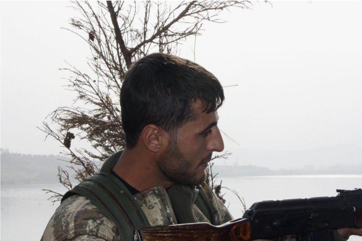
A fighter of the Shams al-Shamal militia at a front line position at Ja'ada, on the east bank of the Euphrates. (Jonathan Spyer)