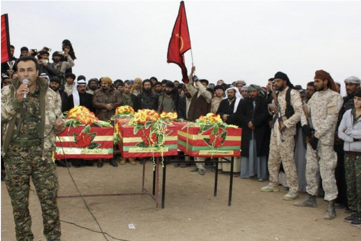
A YPG commander speaks on 18 December at the funeral of three fighters of the Sanadid militia. The YPG is one of the most powerful military forces in northern Syria.

with a number of YPG fighters telling IHS Jane's privately that they did not regard the movement as a partner. Indeed, a YPG attack on a Thuwar Raqqa checkpoint took place in early December 2015, for which the YPG later apologised.