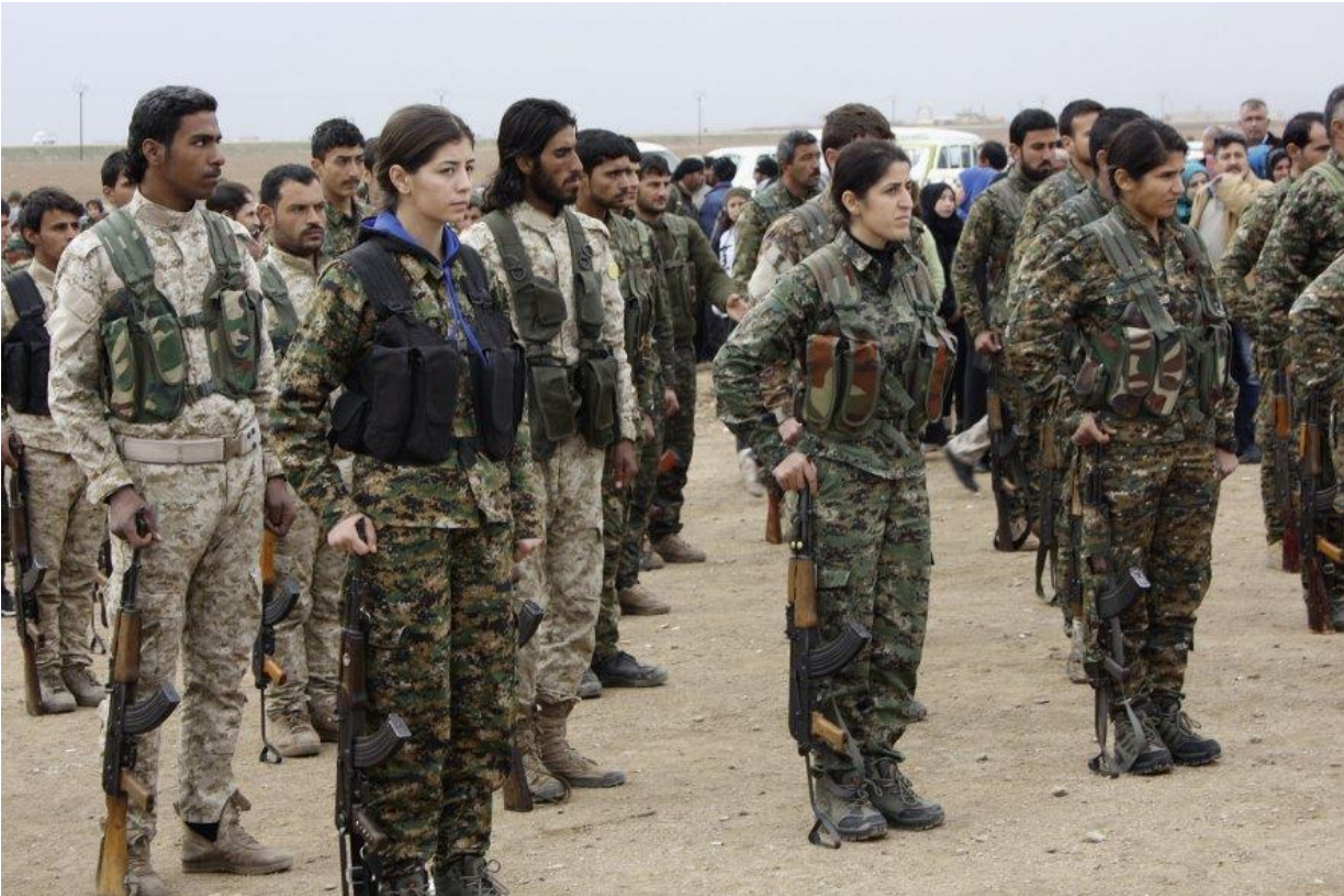
Sanadid, YPG, and YPJ fighters at the funeral in Ja'ada of three Sanadid members killed fighting the Islamic State. The 30-40,000 fighters of the Kurdish YPG and YPJ constitute the large majority of this force. (Jonathan Spyer)