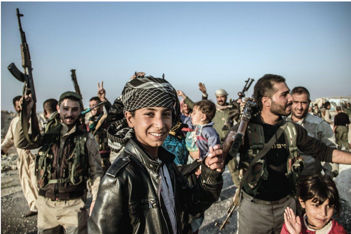
A local teenager celebrates with fighters after his village was liberated on 8 November from the Islamic State. The SDF framework solidifies the limited US-Kurdish partnership against the Islamic State in Syria. (PA)

However, the Western coalition's relationship to this initiative is not clear. It has largely been ignored in media coverage of the Syria conflict, yet if armed groups associated with the initiative are to play a crucial role in challenging the Islamic State in northern Syria, then the political - and not solely military - nature of the initiative will be important. The political ambitions of Syria's Kurds, and the more limited ambitions of the Western coalition regarding the SDF, may be a cause for tension in coming months.