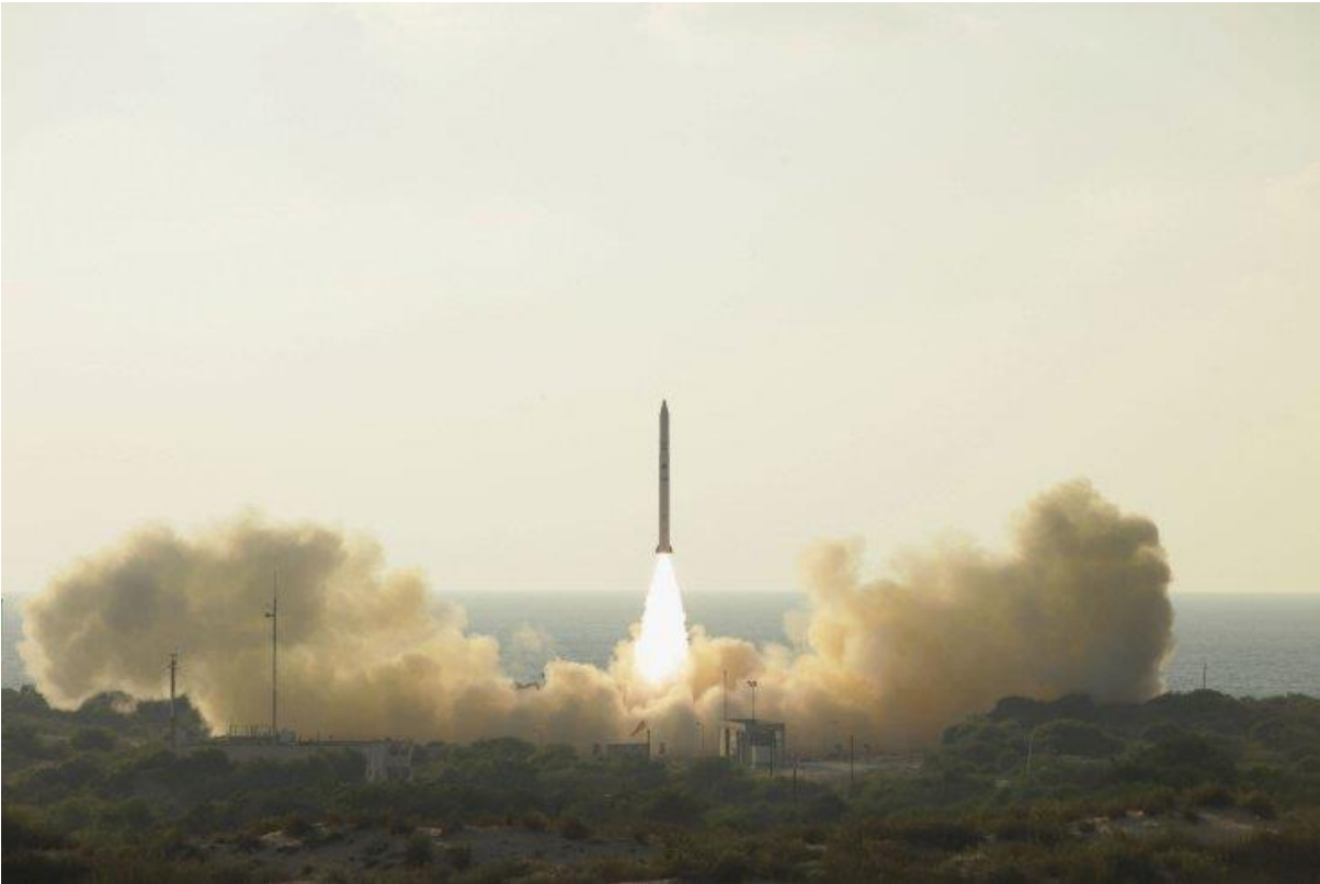
The launch of the Ofek-11, a reconnaissance satellite built by Israel Aerospace Industries. (IAI) 1692959

Chappell said that the ways in which data is analysed and manipulated have evolved in a number of ways. The key is to be able to pool together data from the wide variety of networked sources, from satellites to high-altitude platforms and UAVs.