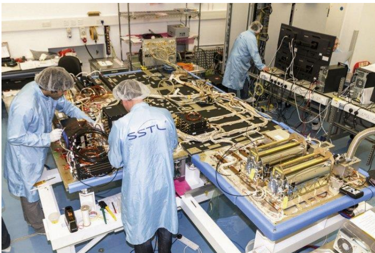
The UK's SSTL is involved in manufacturing the European Galileo satellite network. One of the navigation payloads being tested (pictured).