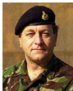
Lieutenant General Dick Applegate