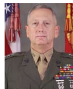
Lieutenant General James Mattis