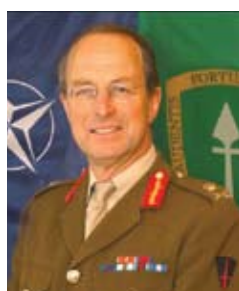
Lieutenant General Sir David Richards